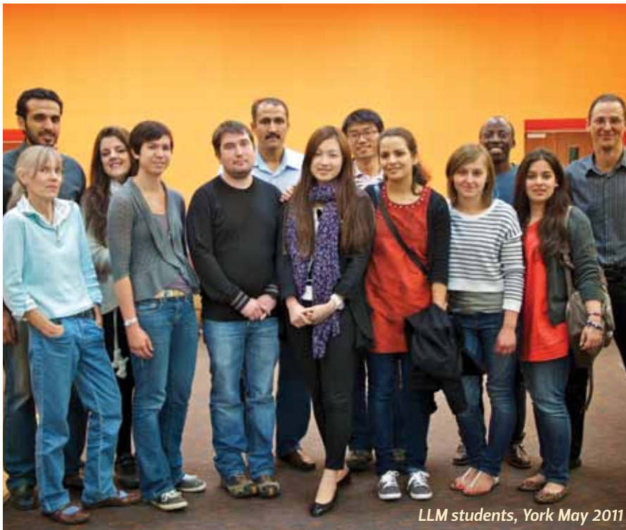
LLM students, York May 2011

“The fieldwork experience I gained during the MA visit to Cape Town inspired my PhD’s exploration of transitional justice, masculinities and male victimisation. Additionally, it gave me a head-start on the PhD by facilitating links with a network of practitioners.”