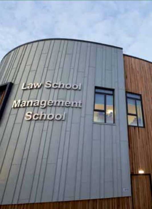
The Law and Management Building