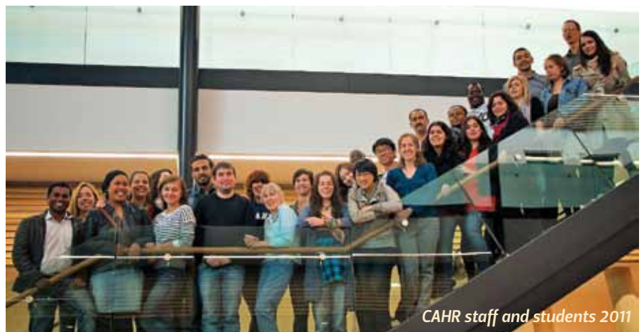
CAHR staff and students 2011