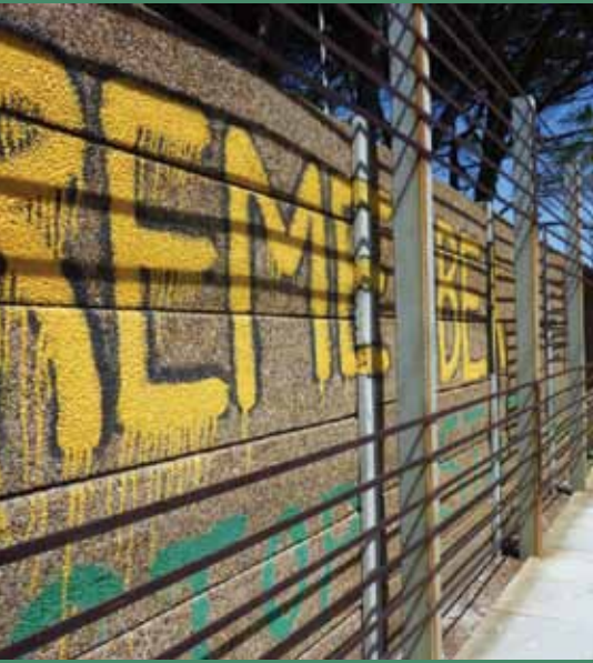
Memorial in Athlone Cape Town