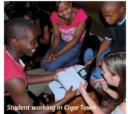
Student working in Cape Town

With a population of 190,000, York is big enough to feel cosmopolitan but small enough not to be overwhelming. It is a friendly place students can settle into quickly and which feels fresh and exciting. York was recently voted Europe's top