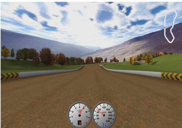
Figure 2: Racing simulator, TORCS, used in Sprint 3.

The prototype was launched at Cambridge Festival of Ideas 2015, where approximately 100 participants tried the game. Feedback to the project was based on one of the designers observing and interacting with the participants. It was felt that the opportunity to interact with such a large number of people gave a deeper understanding of user behaviour in general, and advantages and drawbacks with the design concepts in particular. This experience is supported by literature showing that having the development team taking part in user testing increases their understanding of the usability problems and makes them more sensitive to problems encountered by users [21], [22].