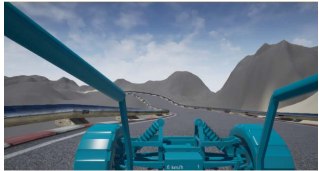
Figure 3: Computer game/driving simulator developed in Sprint 4.

The four concepts developed in Sprint 1-3 (see Table 2) were implemented in a driving game developed using the Unreal Engine 4 game engine. The FMOD game audio middleware was used to allow rapid prototyping of the interactive sounds. The main reason for this change of development platform was to allow for more flexibility in the design of scenarios and game ideas, as well as easy integration with game audio middleware. The new version was demonstrated at Cambridge Science Festival 2016, where more than 300 participants completed a test drive and eco-scores were calculated and presented. A very simple environment and car asset were used (see Figure 3), giving the impression of work in progress and making participants more aware of the objective of the demonstration, helping them pay less attention to details in the game play that were not under investigation.