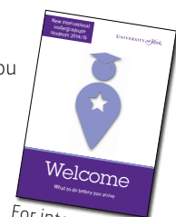
For international students

This welcome pack will be issued to all new undergraduates when their place at York is confirmed.