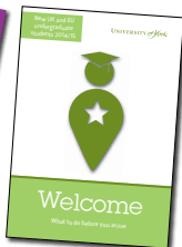
For UK and EU students