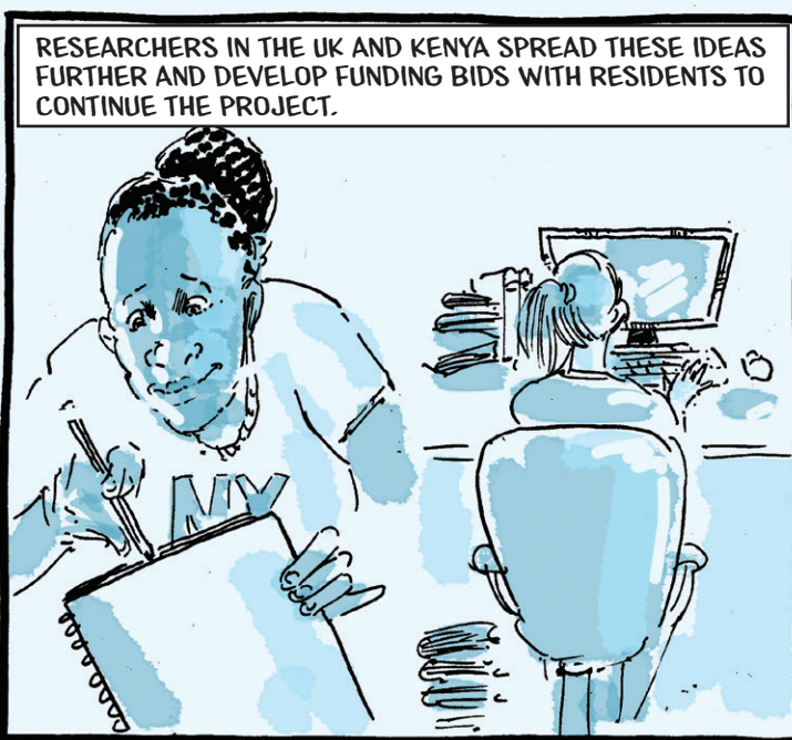
RESEARCHERS IN THE UK AND KENYA SPREAD THESE IDEAS FURTHER AND DEVELOP FUNDING BIDS WITH RESIDENTS TO CONTINUE THE PROJECT.