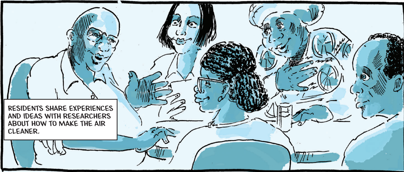
RESIDENTS SHARE EXPERIENCES AND IDEAS WITH RESEARCHERS ABOUT HOW TO MAKE THE AIR CLEANER.