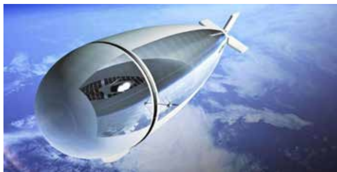
Stratobus airship used as a high-altitude platform

For more information on the University of York's interdisciplinary research themes see www.york.ac.uk/research