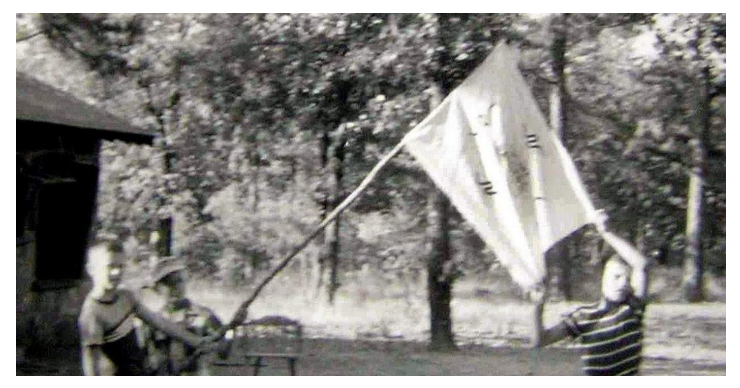
One of the flags being held by boys who took part in the experiment.

existence. Unease and animosity rapidly spread throughout each group, and this will only grow when they compete for prizes. Friction is created between the two groups by games such as tug of war and baseball, with the losing team not even being awarded a consolation prize. Likewise, situations were also devised where one team would gain at the expense of the other. In the run up to the competition, each group set out a game plan to ensure victory would be secured. Rattlers dominated the baseball pitch, hanging their flag in the pitch to ward off any invaders. Just for good measure, threatening remarks are also made to safeguard their training ground.