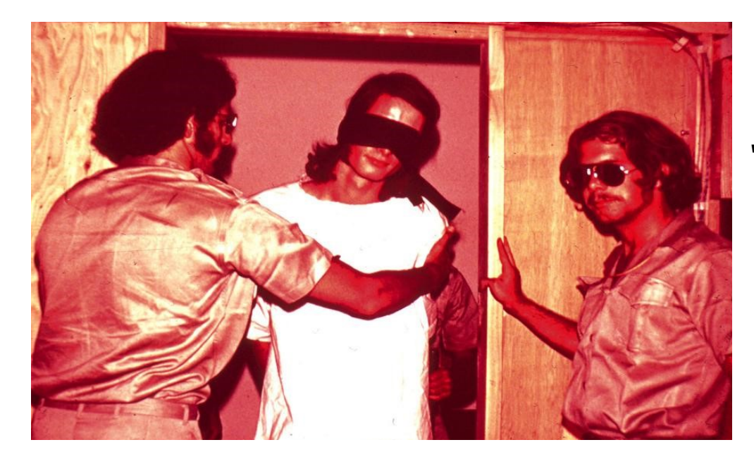
One of the "prisoners" being transported by two of the "guards" from the experiment.

Participants were randomly divided into groups of guards and prisoners. When the experiment began the prisoners were arrested from their homes and taken to the fake prison. Then they were given numbers to replace their names, uniforms to replace their normal