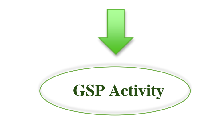
Figure 3: The GSP referral pathway

The SP link worker focuses on what matters to the person and for some people this will be GSP i.e., the practice of supporting people to engage in nature-based interventions and activities to improve their health and wellbeing.