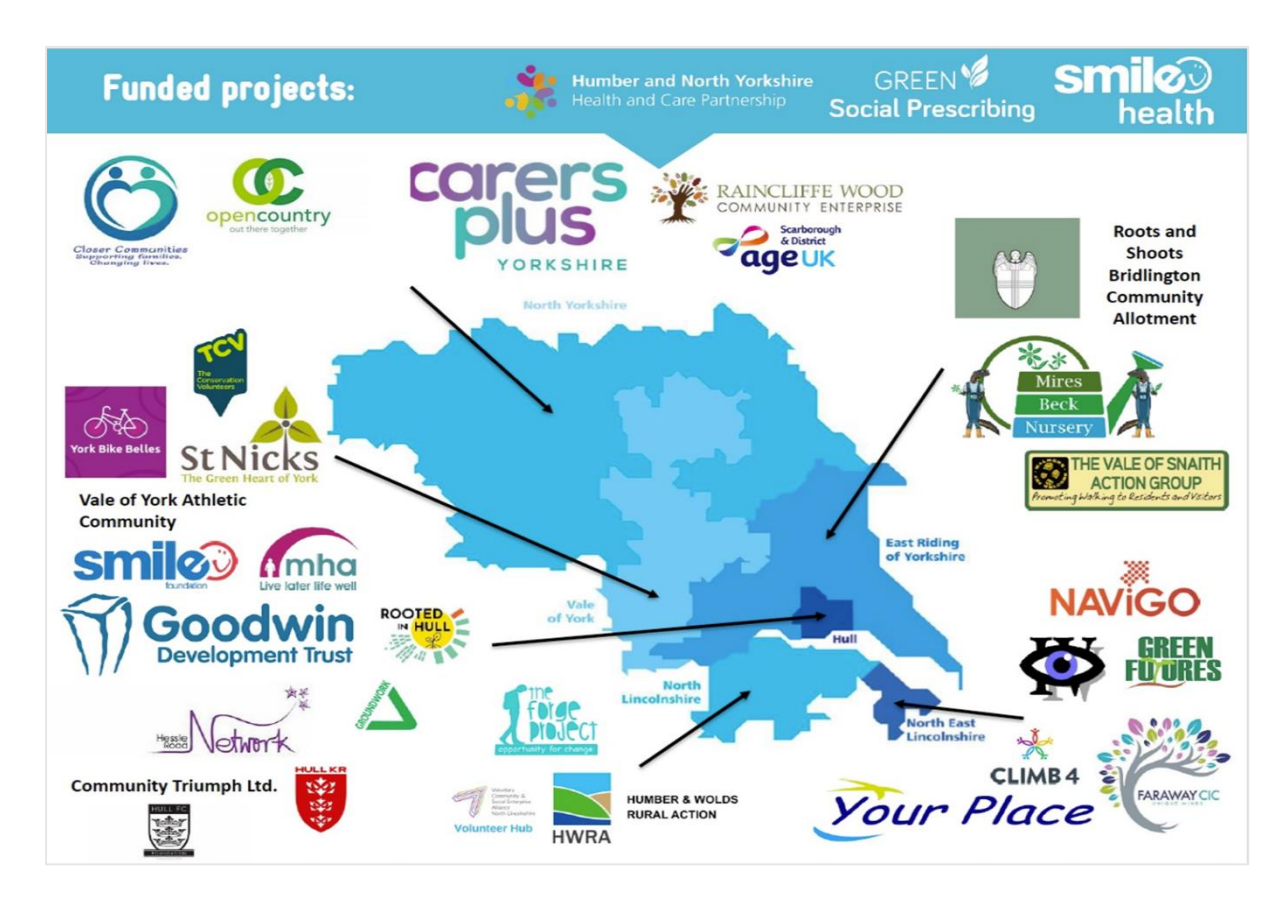
Figure 2: Funded nature-based projects delivered across the six areas of HNY

Nature-based providers were identified by the HNY GSP programme team and shared with the SP/referring services who also utilised existing relationships with provider organisations. In addition to existing nature-based projects being delivered across the HNY region, additional nature-based projects were directly funded by the HNY GSP programme to support the referral of participants into GSP activity.