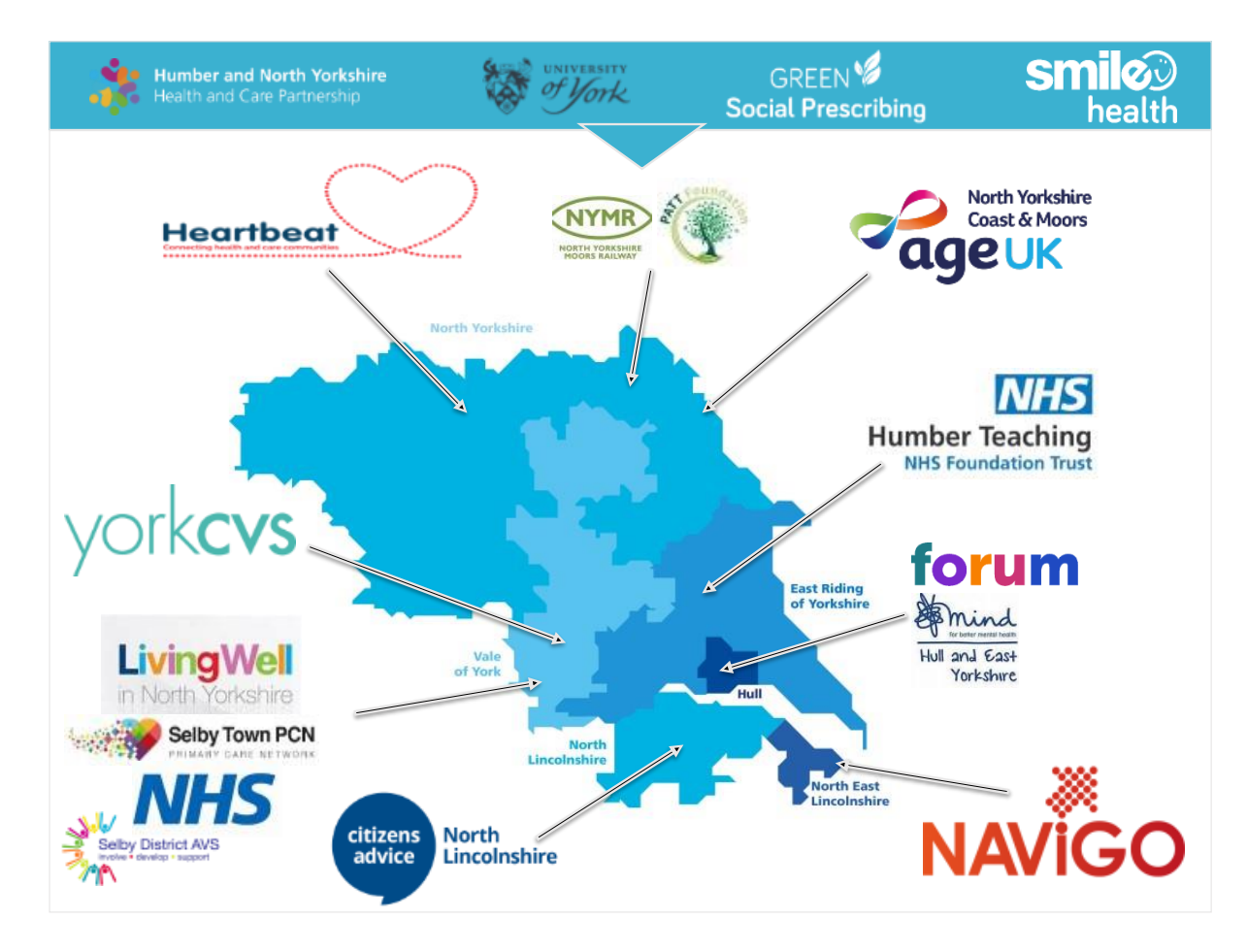
Figure 1: Participating SP/referring services in the cohort evaluation across the HNY region

A wide range of SP/referring services in HNY participated in the HNY GSP programme, including SP services embedded within PCNs, SP services delivered by the VCSE sector and those led by local authorities, alongside mental health services and O/T teams. Participating SP/referring services are summarised and described in Table 1 below.