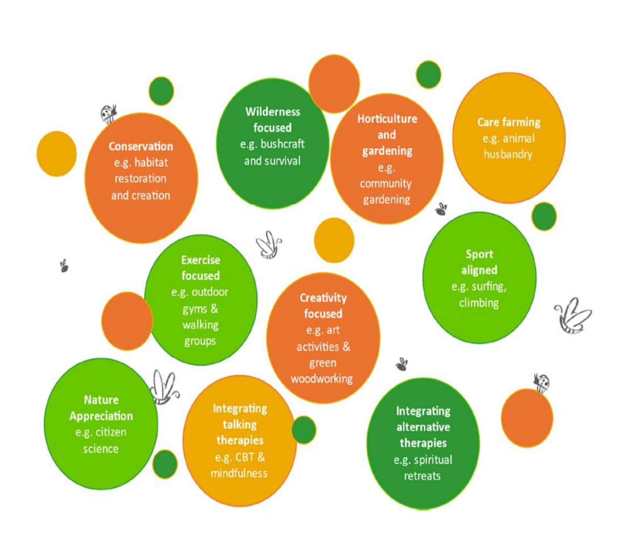
Appendix 4 – Nature on Prescription Handbook Categories

Figure A1: Nature on Prescription Handbook categories for nature-based interventions