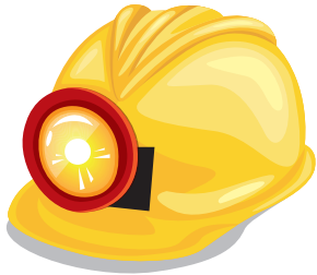
Health and Safety Manager