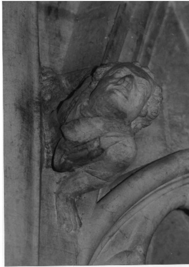
Figure 3. Lapis Vivus?

The importance of the relationship between the individual Christian, and authority, the principal theme of 1 Peter:2, is a theme to which other elements of the York scheme may be linked. The role of the King as supreme authority, and his ‘governors’ as appointed representatives is given emphasis in the armorial symbols contained in windows seen high above any assembly. Members seated within their canopied stalls become themselves the ‘living stones’ of which a divinely ordered creation consists and is being continually rebuilt. In the corbel heads may be seen men and women, perhaps the husbands and wives who St. Peter identifies as representatives of authority within the household in 1 Peter:3. Perhaps his admonition not to trade insult for insult is the message conveyed by the ‘tooth-ache’ figures, goading their observers into unchristian response.