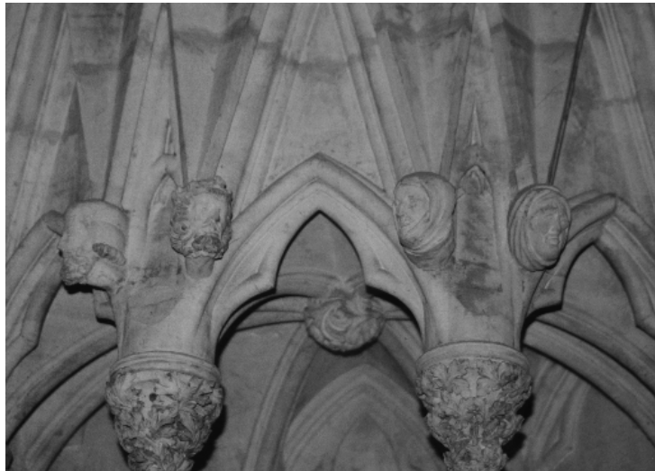
Figure 2. Detail of the sedilia canopy showing carved corbel heads.

The meaning and purpose of these figures has been debated at length. Although subject to some damage during the civil war, it is clear that many of the heads are original and in situ. Aberth suggests that the sheer number of the figures, over 250 individual carvings, and their location just above eye level, make it likely that they were conceived as an integral part of the meaning and context of the sedilia. 15 Represented amongst the figures themselves are a mixture male and female figures, variously attired. Some are clearly of high status, bearing either knightly attire, veils, or crowns and coronets. Others are more simply clad in caps, hoods or wimples. Accompanying the human figures are a series of realistic representations of animals, including monkeys, dogs and boars. The third and most problematic group are the allegorical figures, which I take to include both representations of mythical beasts, and human figures whose posture and expression clearly indicates some particular meaning, most notably the ‘tooth-ache’ or ‘ire’ figures. There is possibly some connection between this series of allegorical figures and similar figures painted in the ceiling vault, recorded by Torre and discussed by Norton. 16