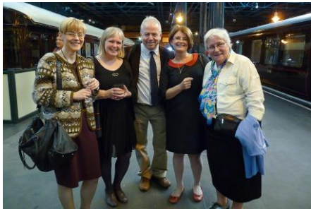
Delegates from Belgium, Iceland and Turkey

A major international conference took place at York in May 2012. Over 200 delegates from 41 countries gathered at the National Science Learning Centre to explore issues about citizenship and identity with particular respect to community building. This joint conference was hosted by 3 significant groups: CitizED, a global network of academics; the Children's Identity and Citizenship in Europe Academic Network, (CiCe), a European network of academics and professionals funded by European Commission; and the Department of Education, University of York and NFER project team of the Esmée Fairbairn funded initiative 'Creating Citizenship Communities'.