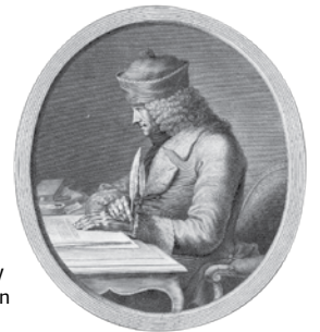
Voltaire, Napoleon and Rousseau were among the great figures of the Enlightenment who were influenced by George Sale’s translation of the Qur’an