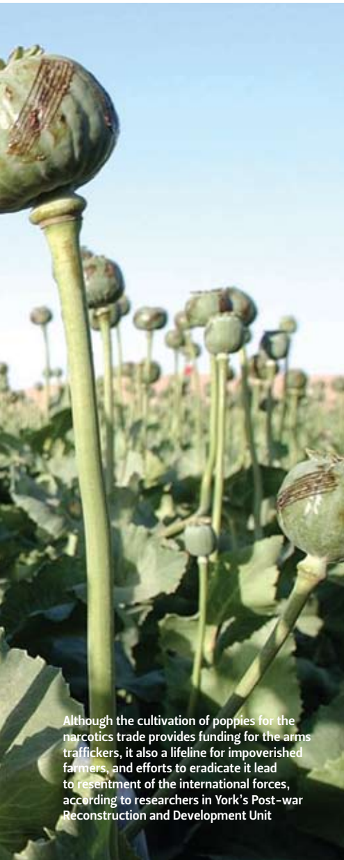
Although the cultivation of poppies for the narcotics trade provides funding for the arms traffickers, it also a lifeline for impoverished farmers, and efforts to eradicate it lead to resentment of the international forces, according to researchers in York's Post-war Reconstruction and Development Unit

without narcotics trafficking to finance it.