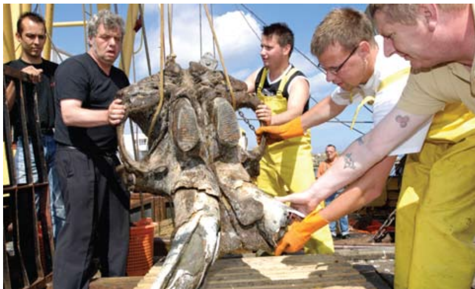
North Sea trawlers frequently scoop up the fossilised remains of prehistoric animals – such as this mammoth head – which once roamed land now covered in water