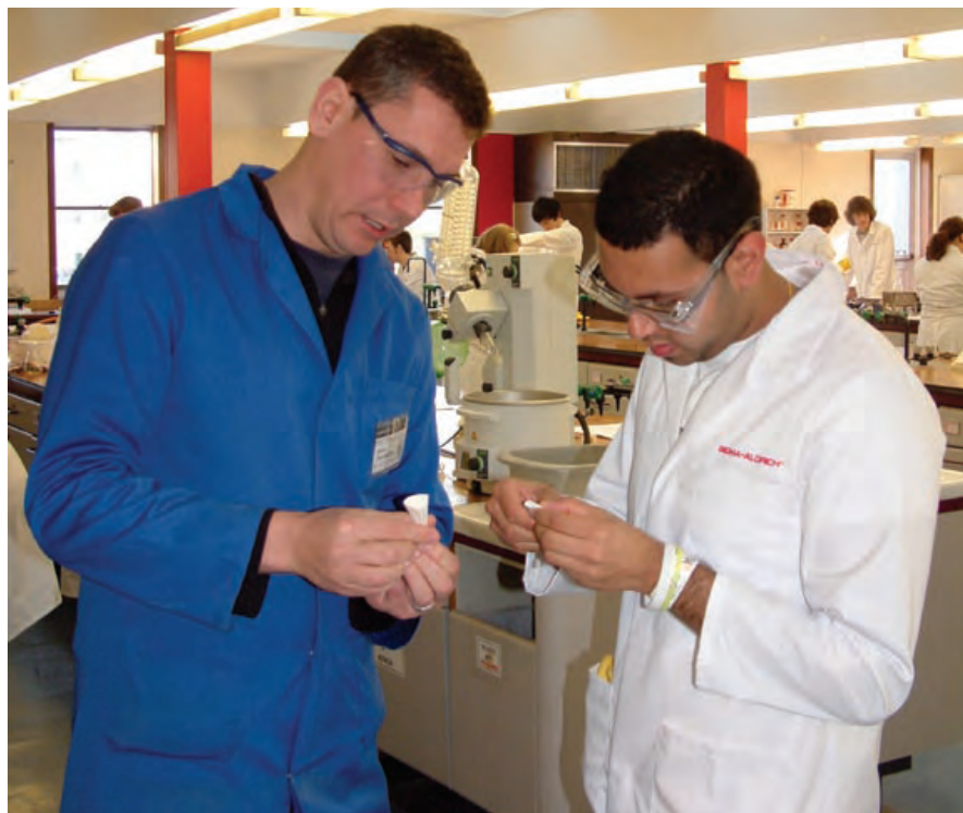
In practical classes, students are supervised by academic staff and postgraduate students

This is a programme about the chemistry of life. It provides the opportunity to learn about