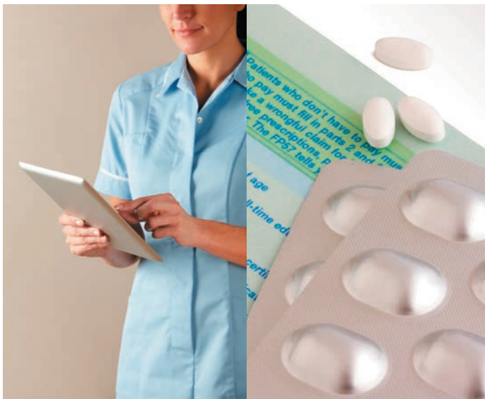
Improving the productivity of the NHS