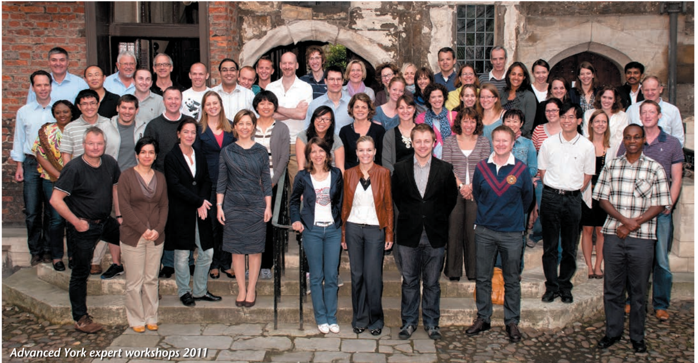
Advanced York expert workshops 2011