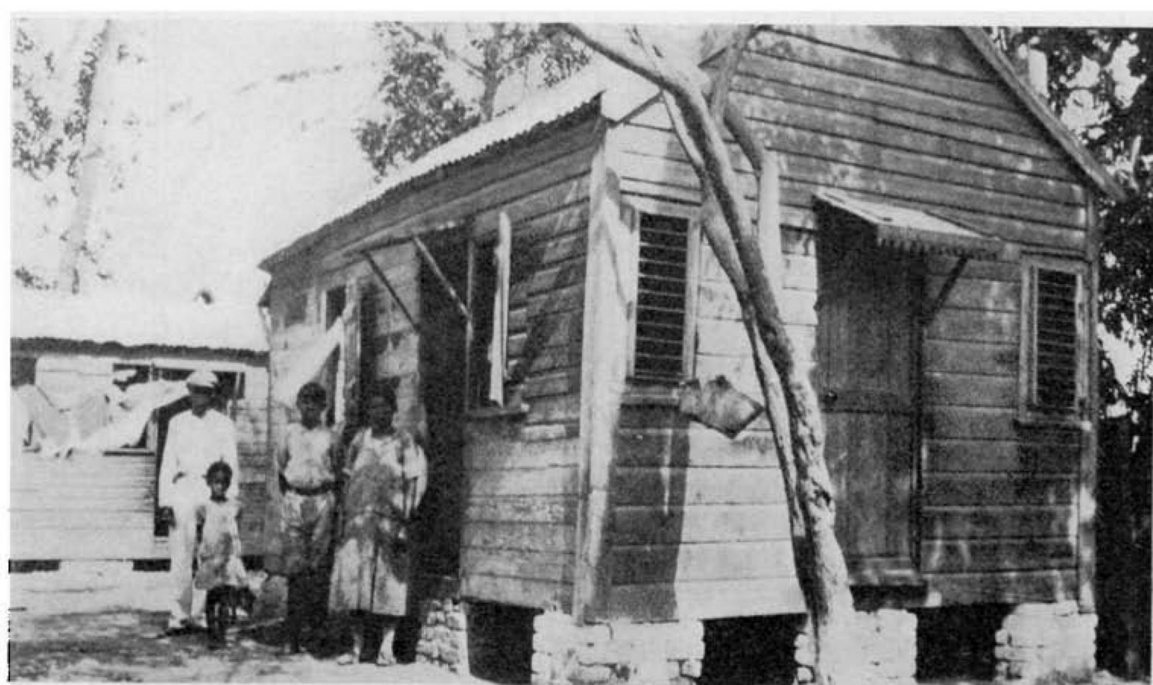
FIG. 26. Photograph of the interior of the yard occupied by family 151. The rooms marked A in fig. 25 are shown in the foreground and those marked B and C in the background.

This social and cultural history of public health in the British Caribbean will not only shed greater light on the nature of colonial rule in the region, in particular the extent to which colonial governments helped to uphold racial and class hierarchies. It will also challenge the idea that race and ethnicity ceased to matter after independence by exploring in detail the attitude of post-colonial governments towards the control and treatment of TB.