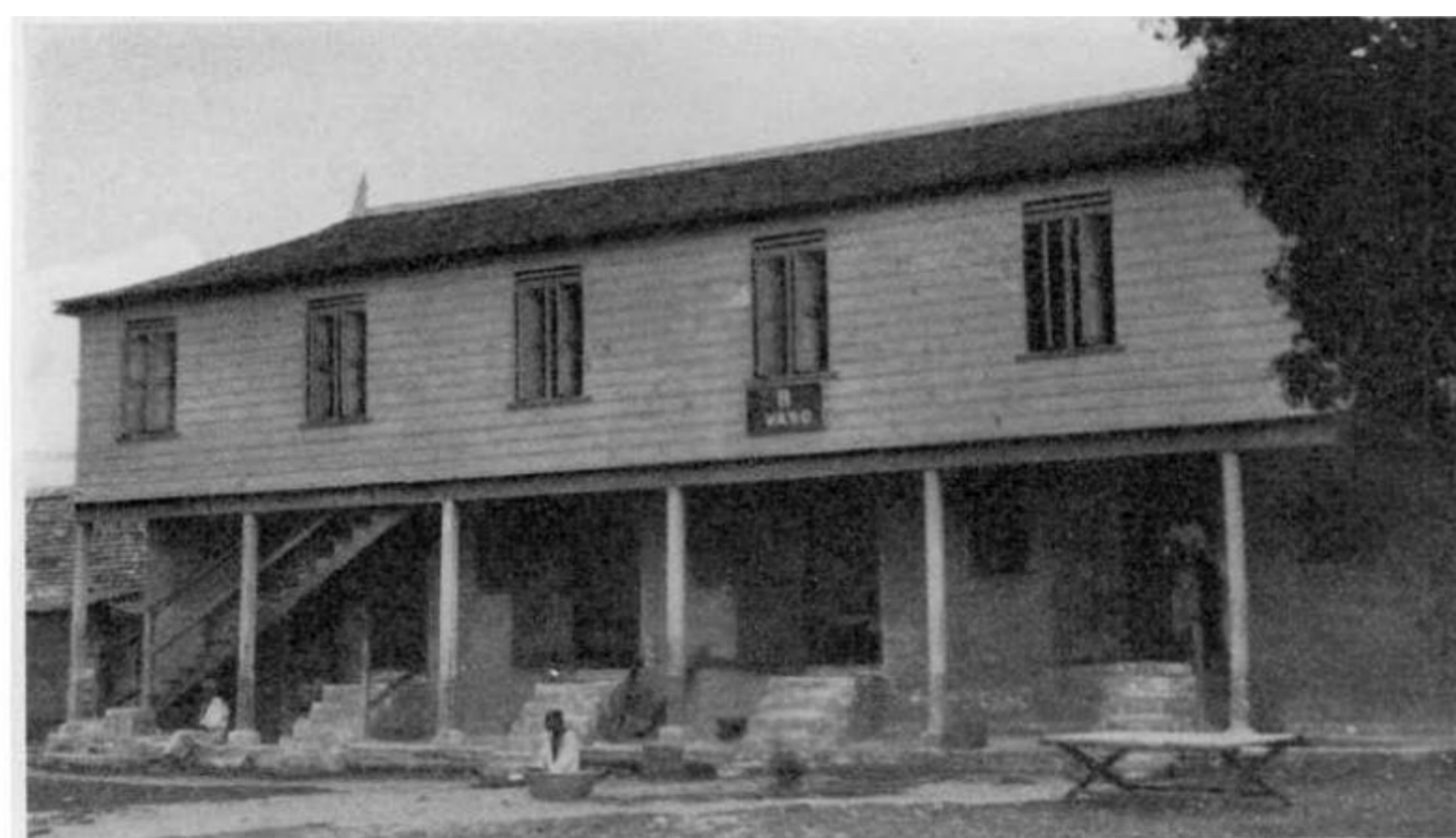
FIG. 33. Photograph of the barracks for male tuberculous patients at the poor house of Kingston and St. Andrew.

The project also assesses the financial and other support that colonial governments received from the Imperial government as well the Rockefeller Foundation and other American organisations in their fight against TB; the role played by voluntary and professional health workers in the prevention, control and treatment of the disease; the responses of the population to prevention and control campaigns; and the attitude of TB patients towards the treatment offered in sanatoriums.