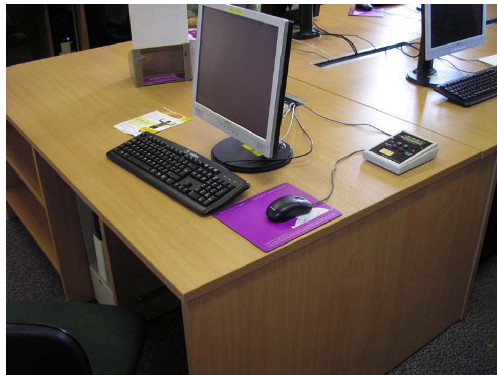
Projector and PC Operating Instructions e.g. PC Classrooms