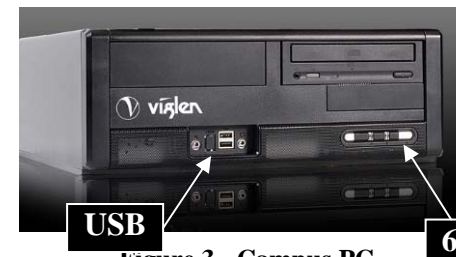
Figure 3 - Campus PC

Use the power button [6] to turn on the PC. Log in using your computing service username & password. Check that "Log on to" is set to "CSRVDYORK". A USB port is located on the front panel. In most of these rooms, the PC is provided by Computing Service rather than AV.