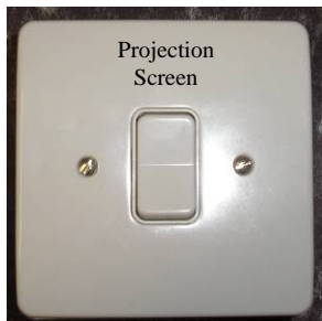
Figure 2- Typical Projection Screen Switch

Turn the projector on using the green on [1] button in the top left hand corner. The projector will take up to a minute to warm up, during which time the on button will flash.