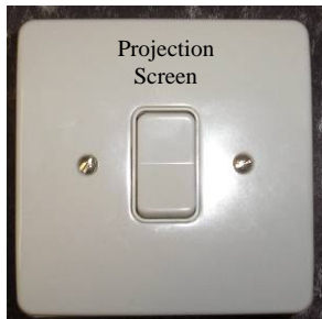
Figure 2- Typical Projection Screen Switch

Turn the projector on using the display on [1] button in the top left hand corner. The projector will take up to a minute to warm up, during which time the on button will flash.