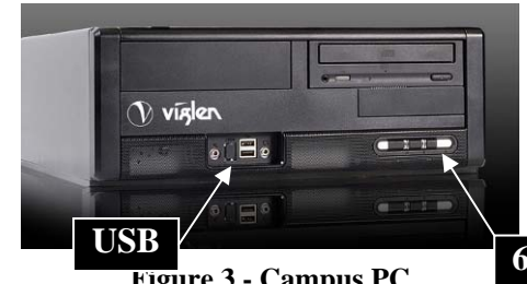
Figure 3 - Campus PC

Use the power button [6] to turn on the PC. Log in using your computing service username & password. Check that "Log on to" is set to "CSRVDYORK". A USB port is located on the front panel.