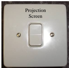
Figure 2- Typical Projection Screen Switch

Turn the projector on using the green on [1] button in the top left hand corner. The projector will take up to a minute to warm up, during which time the on button will flash.