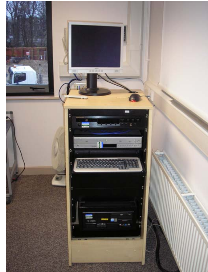
Neptune Equivalent Operating Instructions