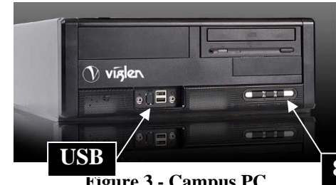
Figure 3 - Campus PC

Use the power button [8] to turn on the PC. Log in using your computing service username & password. Check that "Log on to" is set to "CSRVADYORK". A USB port is located on the front panel.