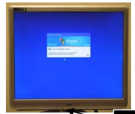
Figure 7 - Campus PC

If no picture is displayed on the monitor on the lectern, press the power button at the bottom in the centre of the monitor [7].