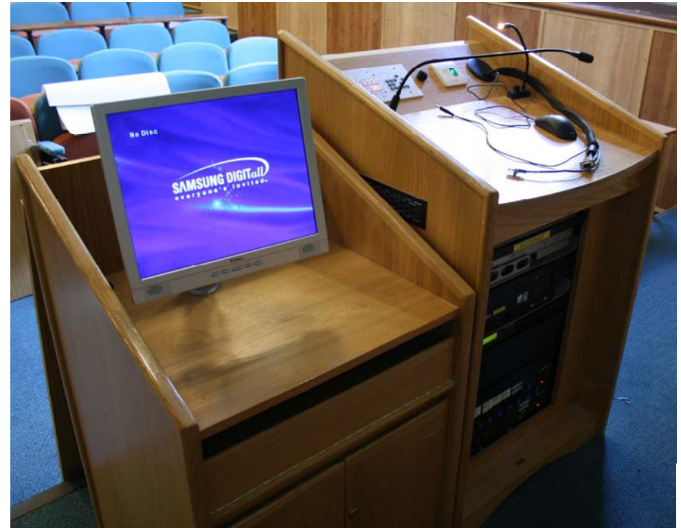
Fitted Lecture Theatre Operating Instructions