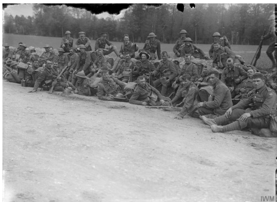
Troops of the 7 th Battalion resting on their way back from the trenches, near Albert, May 1917.