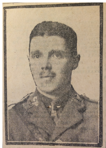
Photograph, found in Senate House Library Archives, Central File series, 1916-17 Staff Records (ref. UoL/CF/1/17/636)