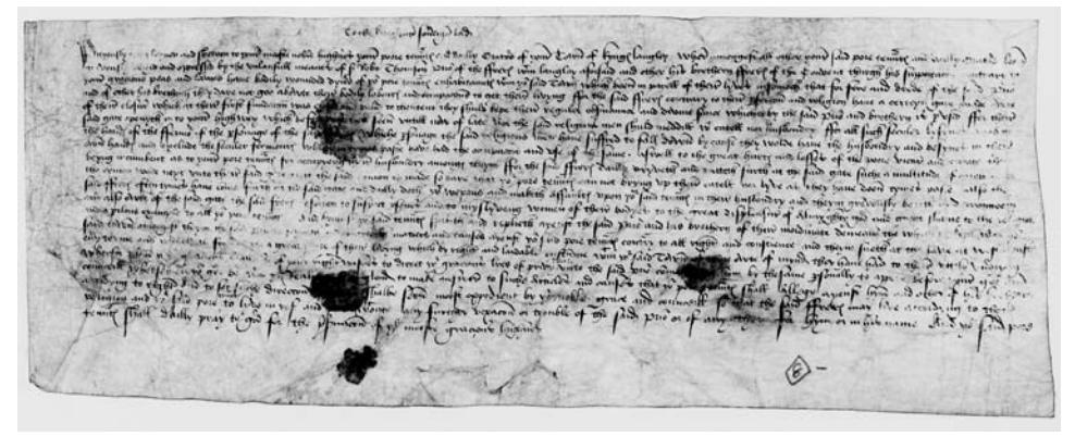
SC 8/345/E1324. A petition from the tenants of the town of King's Langley, 1425-50, against the Dominican Friars of King's Langley.

that the friars were failing to live up to some of the basic ideals of their religious vocation. 'Contrary to their profescion and religion', it reads, '[the friars] have a certeyn gate made owte of their closure, which at their first fundacion was close and pulid, to th'entent they shuld kepe their regular observaunce and divine service'. As a result of this new access to the outside world it was claimed that, 'the said religious men have suffred to fall down by cause they wolde have the husbandry and besynes in their own handes'. It was not right, it was asserted, that religious men should 'medill with catell nor husbondry'. The friars were also accused, perhaps predictably, of 'resorten to suspect persones and to myslyveng women of their bodyes, to the great displeasure of Almyghty God'. Finally, the king was implored to intervene, 'so that the said freres may live according to their religion'.