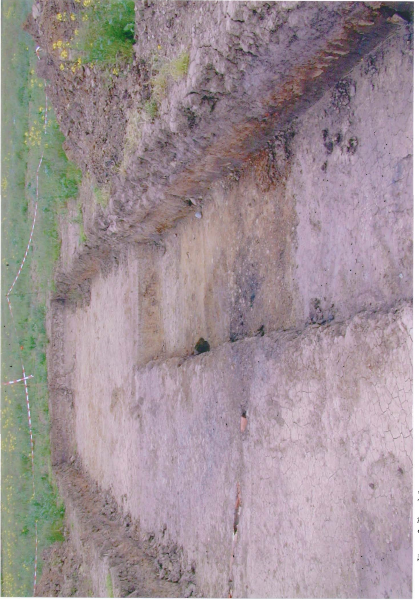
Figure 2. Trench 9