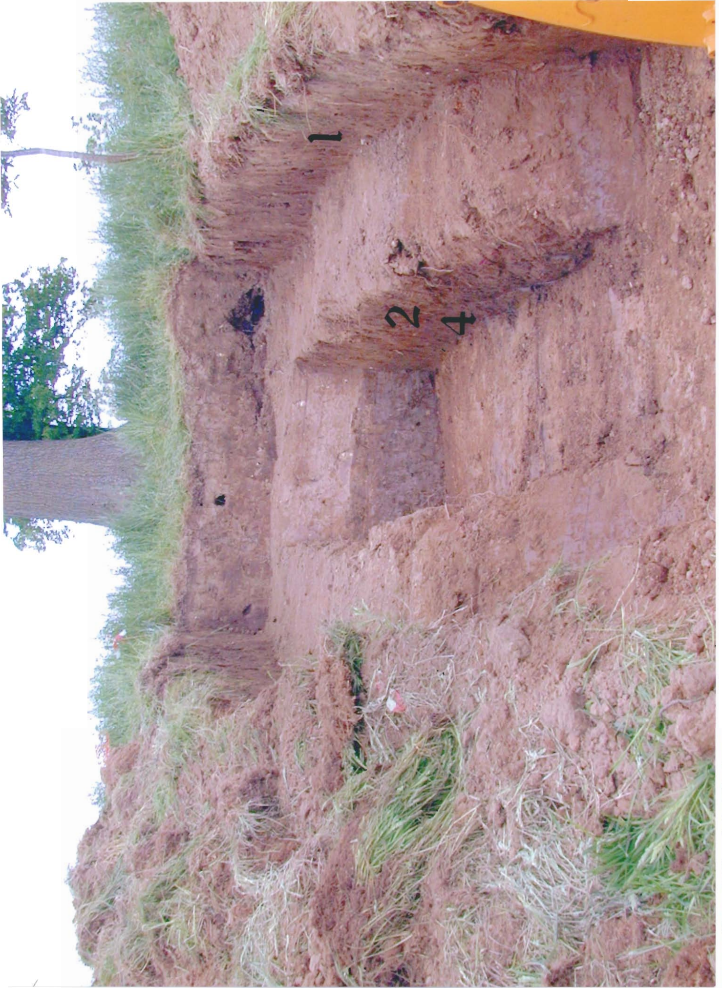
Figure 3. Trench 6 within the prospect mound.