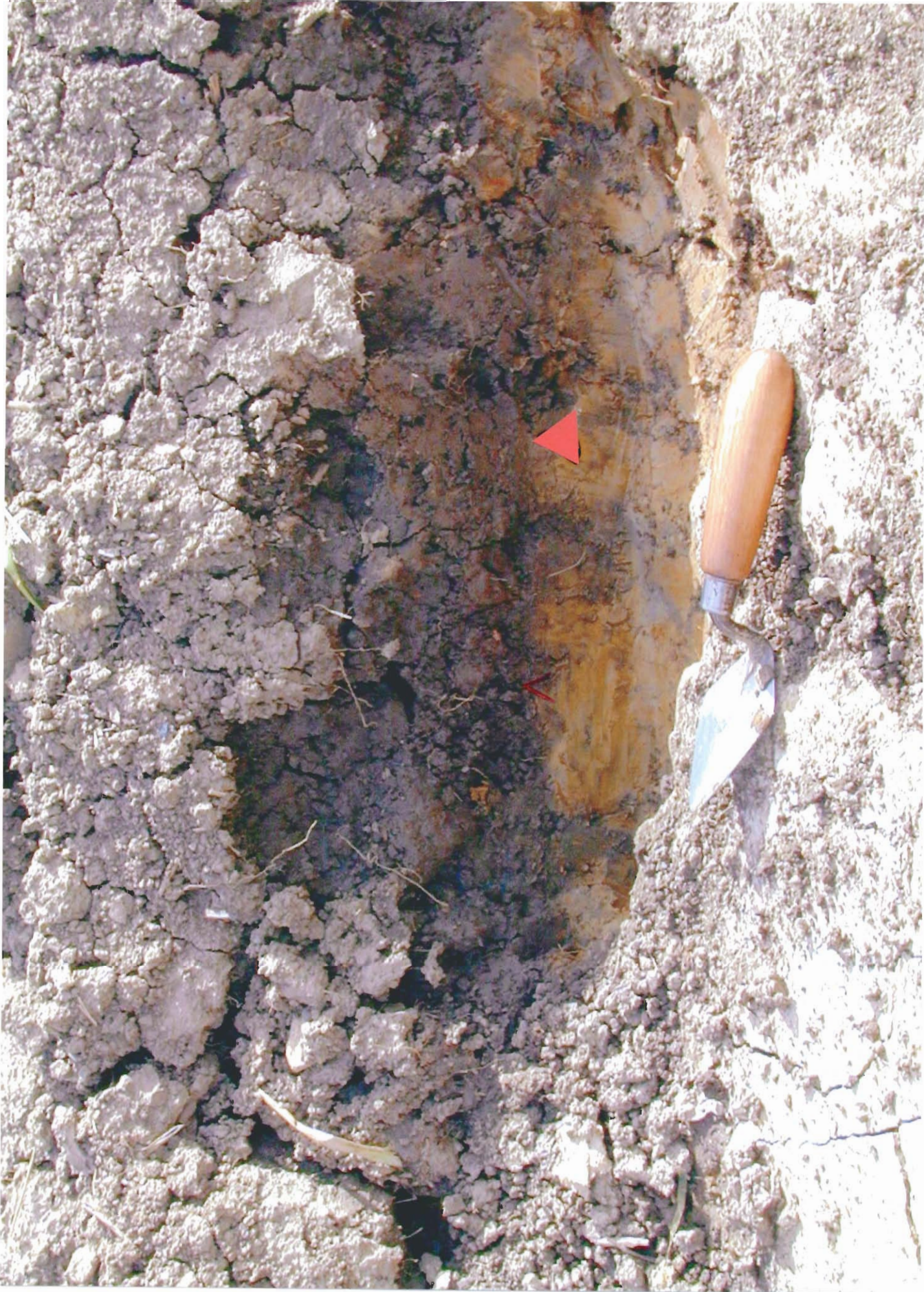
Figure 5. Trench 5: the red triangle indicates the position of the boundary between modern plough soil (upper greyish material) and the buried truncated in situ soil (yellowish brown material)