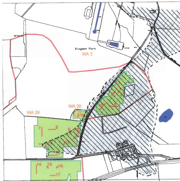
Figure 1. Approximate location of the Dunkeswick Series (hatched area) and restored opencast soils (plain).

includes: angular sandstones, fragments of coal, ironstones, and often also bricks, slag, cinders and, rarely, fragments of discarded mining equipment ( ibidem ).